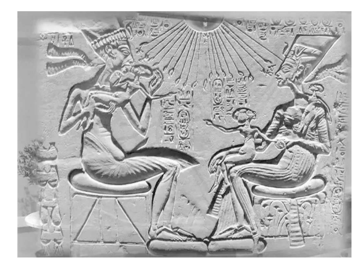
Fig. 1. An image showing Akhenaten, Nefertiti and three children exposing themselves and a house plant to the healing rays of sunlight. The religious symbols in the image suggest that the Ancient Egyptians venerated and worshipped the sun.

The Greeks and the Romans clearly recognized the healing power of the sun. They built solariums and sunbaths, and the Greeks even used them to enhance the strength of athletes preparing for the Olympic Games by exposing them to several months of sunlight treatment. The word, heliotherapy, actually derives from the Greek name for their sun god, "Helios"; heliotherapy meaning sunlight therapy [23–26]. Furthermore, Ayurvedic medical records show that as far back and 1400 BCE; Hindus used the combination of sunlight and photosensitive herbs, such as furocoumarins, to treat vitiligo and other conditions—a combined treatment, which many refer to today as photodynamic therapy [27]. Moreover, records indicate that heliotherapy was a